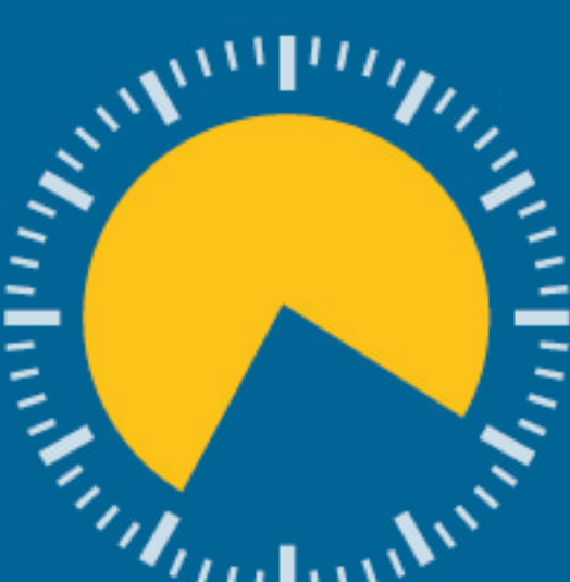
FULL DAY CHARTER 7 AM-4PM