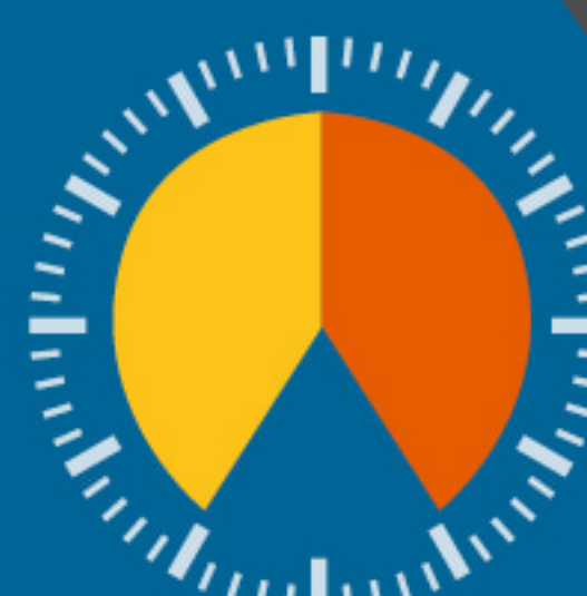
HALF DAY CHARTER 7 AM-12PM | 12PM-5PM